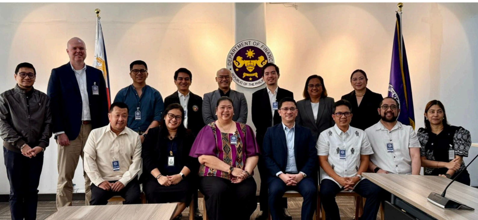
JFC Discussion on RMC-05 with DOF Usec Charlie Mendoza

The Joint Foreign Chambers of the Philippines (JFC) is a coalition of the American, Canadian, European, Japanese, Korean chambers and PAMURI. We represent over 2,000 member companies engaged in over $100 billion worth of bilateral trade and some $30 billion of investments in the Philippines. The JFC supports and promotes open international trade, increased foreign investment, and improved conditions for business to benefit both the Philippines and the countries the JFC members represent.